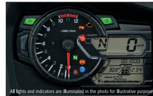
Multi-functional Instrument Panel