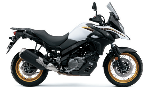
Pearl Glacier White (YWW)

f/Suzuki2wheelers /Suzuki2wheelers /Suzuki2wheelers /Suzuki2wheelers