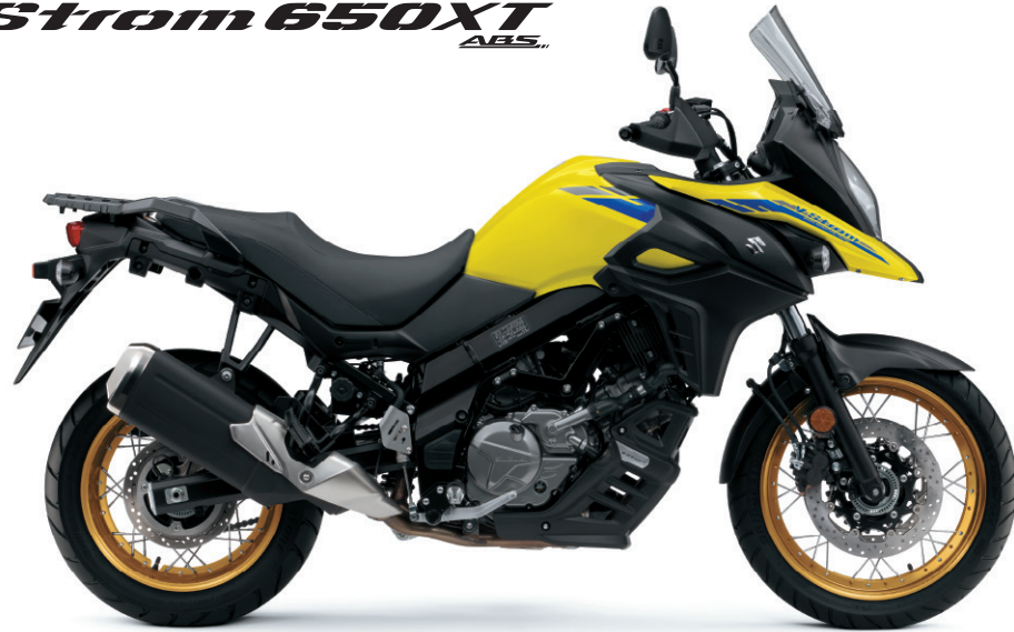
Champion Yellow No.2 (YU1)