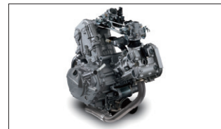
645cm³ DOHC V-Twin engine